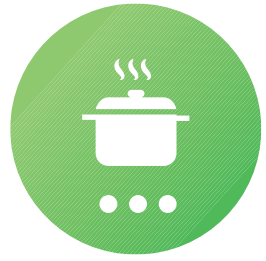
Green Spot 3 COOK

Motivate every member to Start the Green spot journey.